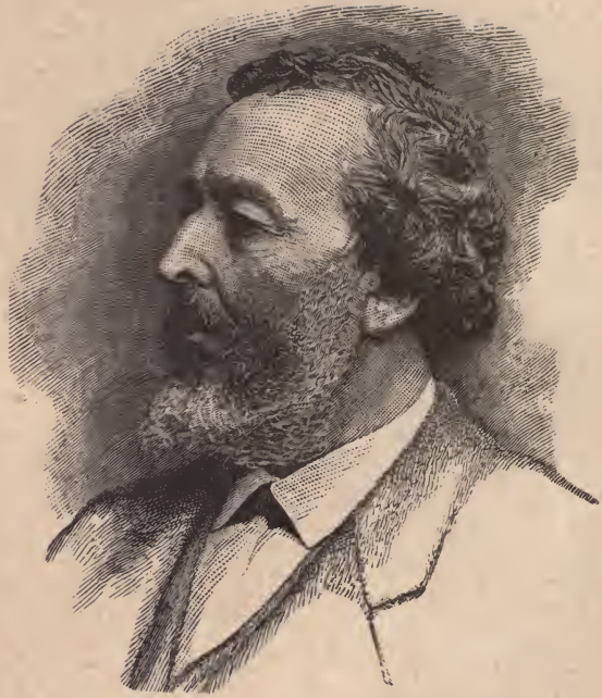
From a photograph by Gutekunst, taken in 1878.